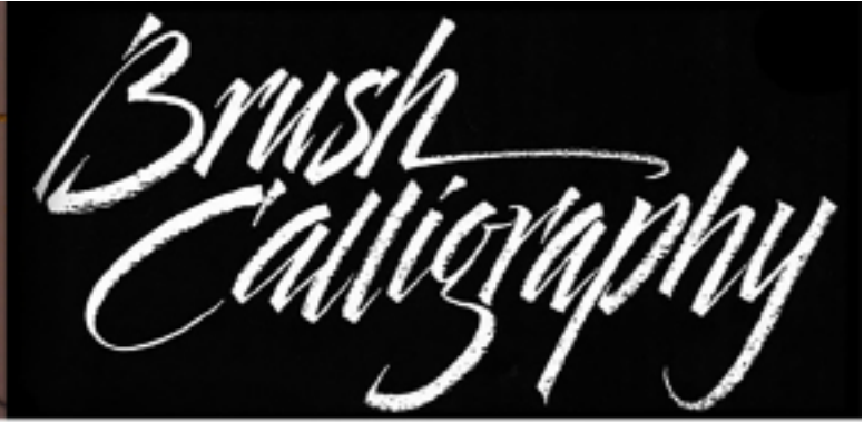
Carol DuBosch Brush Calligraphy October 27-29, 2017